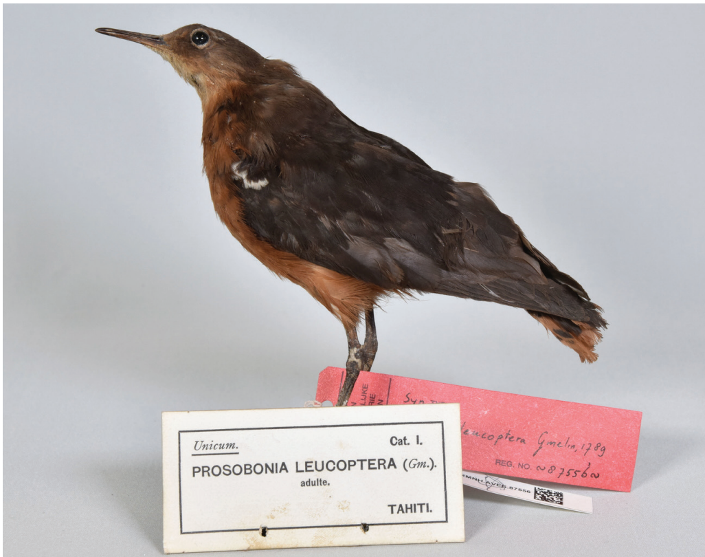
Figure 4. Tahiti Sandpiper Prosobonia leucoptera , RMNH.AVES.87556; note the pale head compared to Fig. 1