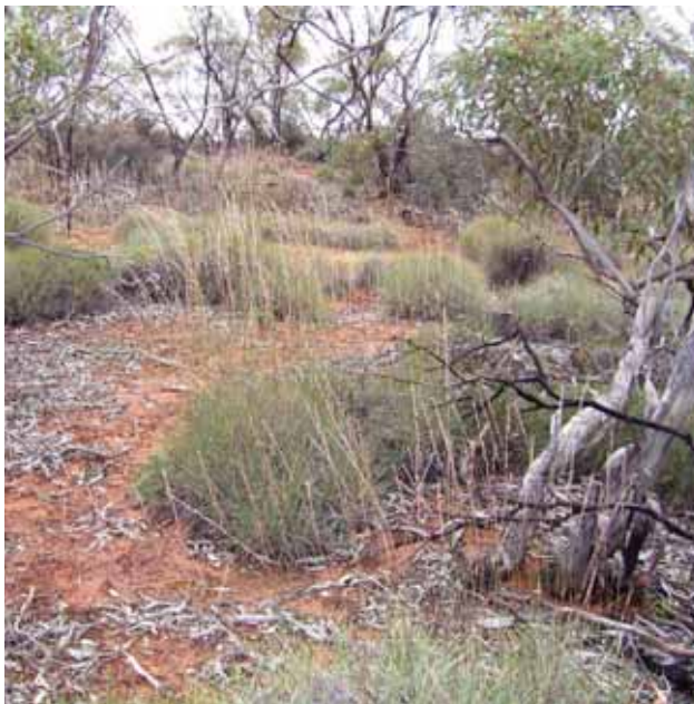
Striated Grasswren habitat at Cooltong Conservation Park

A lot of grasswren habitat was cleared during the last century, which not only greatly reduced their population size, but also left them scattered in isolated remnants across the landscape. These isolated populations face greater risks of decreased genetic health and of being lost to wildfires, as there may be no way for them to move between habitat patches. Fire and drought acting together in a fragmented and degraded landscape are this species' largest threats. Illegal trapping for the aviculture industry is a localised problem and could heavily impact smaller populations.