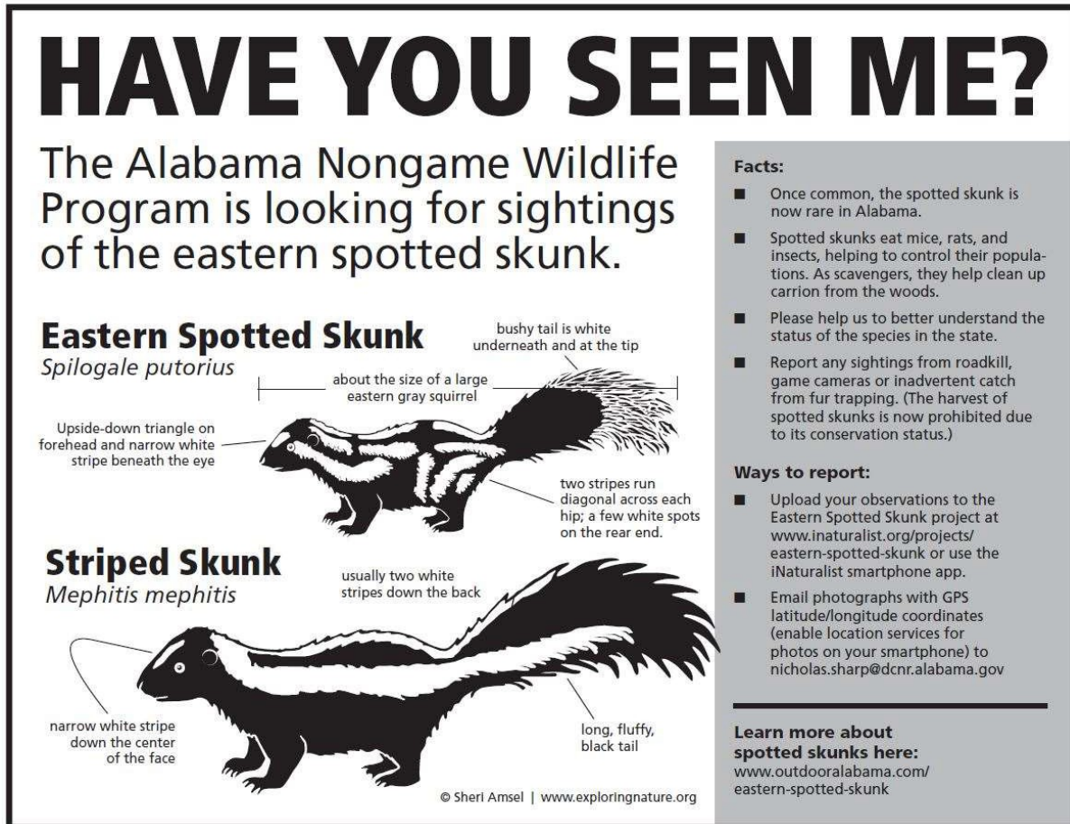
Figure 2. Flyer developed in Alabama for collecting sightings along with an explanatory drawing developed by Sheri Amsel for helping the public differentiate between striped and spotted skunks.

Mead (1968) determined that the breeding season for the Florida subspecies is extended compared to the other subspecies. An average litter size of 5.5 has been recorded for the species (Mead 1968). Males have larger ranges during the breeding season (in spring) as they are likely searching the landscape for reproductive females to mate with, a behavior known as “questing” (Crabb 1948, McCullough and Fritzell 1984, Lesmeister et al. 2009).