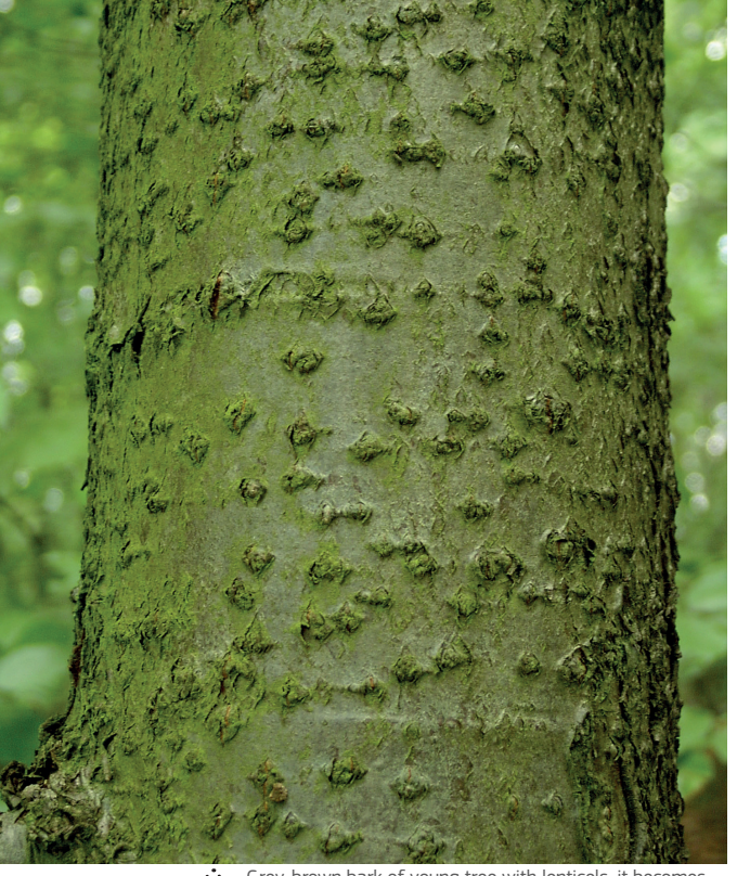
Grey-brown bark of young tree with lenticels, it becomes fissured into scaly plates when mature

Due to efficient seed dispersal by birds and small mammals, and the ability to spread vegetatively by root suckers, the species can easily colonise appropriate sites, such as larger gaps, clearings, low-density forests and abandoned agricultural land surrounded by forests, thus remaining permanently present in the landscape8. Regarding soil characteristics it is a very tolerant species that can grow on both acid and basic soils (from clay to limestone), with a pH ranging from 3.5 to 8 and humus types from dismoder to carbonate mull<sup>2</sup>. It avoids both dry sandy soils and wet or marshy soils and reaches its best growth on warm-dry limestone soils<sup>1.2</sup>.