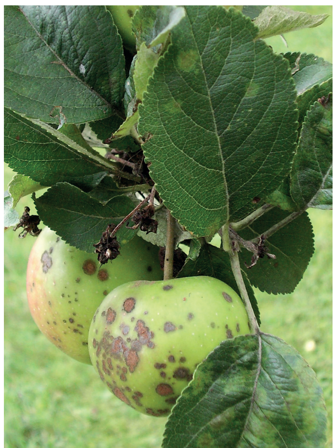
Apples affected by the disease Venturia inaequalis; this Ascomycete fungus can affect also wild service tree.

The wild service tree is one of the most valuable hardwoods in Europe. The wood is fine-grained, very dense and has good bending strength. In earlier times it was used to make screws for winepresses, billiard queue sticks, musical instruments and turnery. Today, it is mainly used for decorative veneers. Quantitatively, the wild service tree wood is of low importance for the European wood market since only several thousands of cubic metres are harvested yearly2.