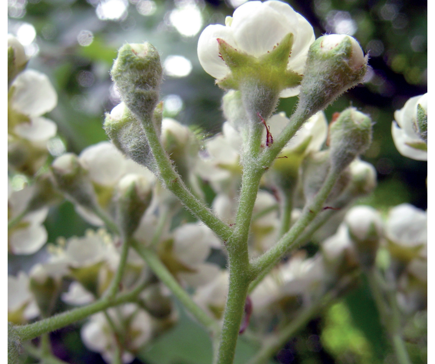
· · · Flowers are arranged in corymbs of 20-30 individual blossor