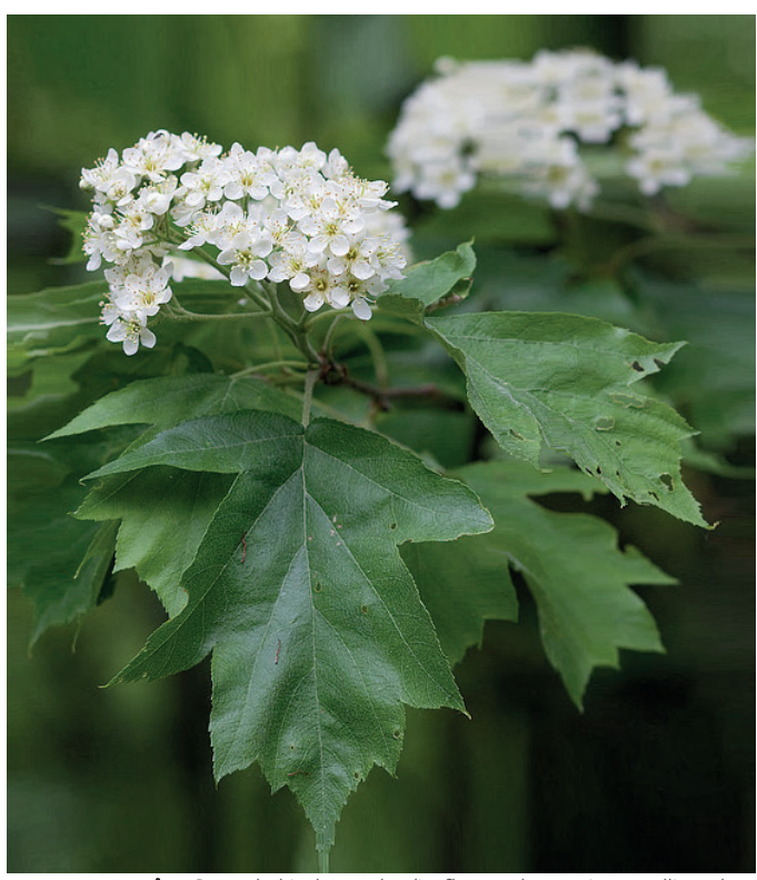
Scented white hermaphrodite flowers: they are insect pollinated