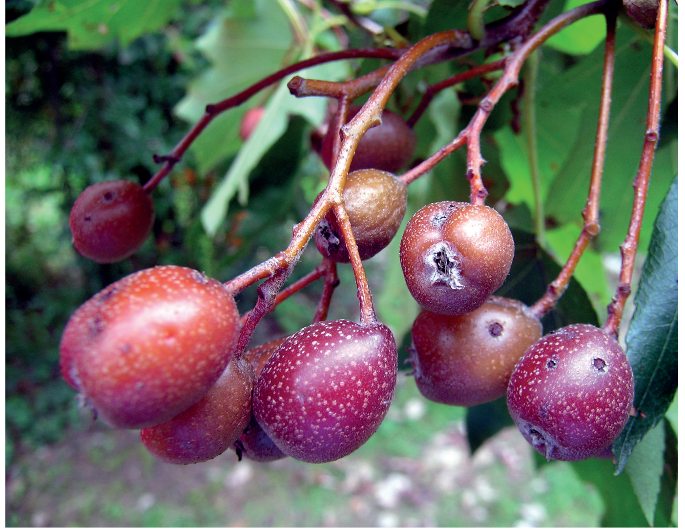
Maturing reddish fruits: these small pomes are edible and very astringent until over-ripe (bletted)