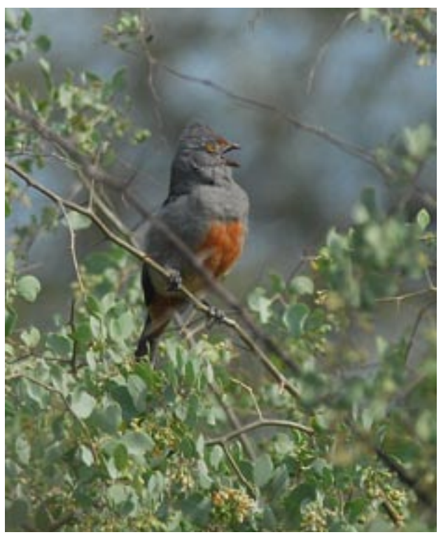
Male Peruvian Plantcutter