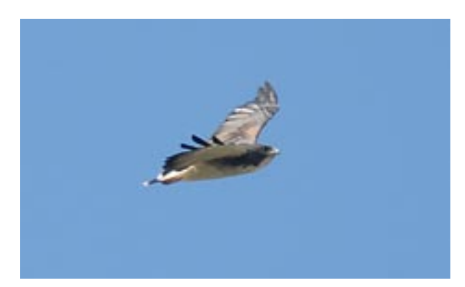
Adult pale morph White-tailed Hawk

3 seen between Cajamarca and Celendin and 1 at Abra Barro Negro