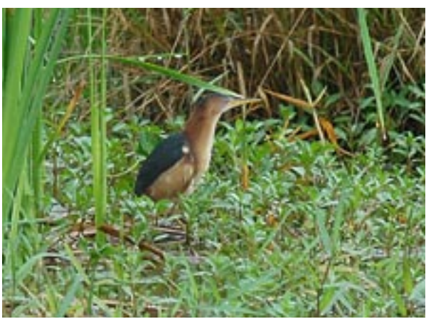
Least Bittern at Bagua

3 seen near Santa Rosa and 2 seen at Tinajones reservoir