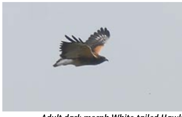
Adult dark morph White-tailed Hawk