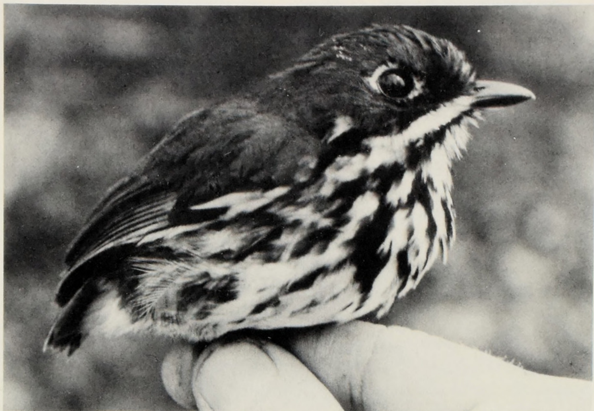
FIG. 1. Female Grallaricula ochraceifrons .

brown; axillars and carpal coverts light ochraceous buff. A thin buffy-white malar mark, bordered above and below by black, extends from the base of the bill posteriorly to lower lateral throat region; center of throat white, tinged faintly with buff and bordered laterally with black and buff feathers; feathers of upper breast and sides buff bordered laterally with wide black margins, producing a heavily streaked appearance; lower flanks indistinctly streaked olivaceous brown and dark brown; center of lower breast, belly, and undertail coverts white. Soft parts in life: iris dark brown; maxilla black, distal half of mandible black, light pink basally; tarsi and feet grayish pink.