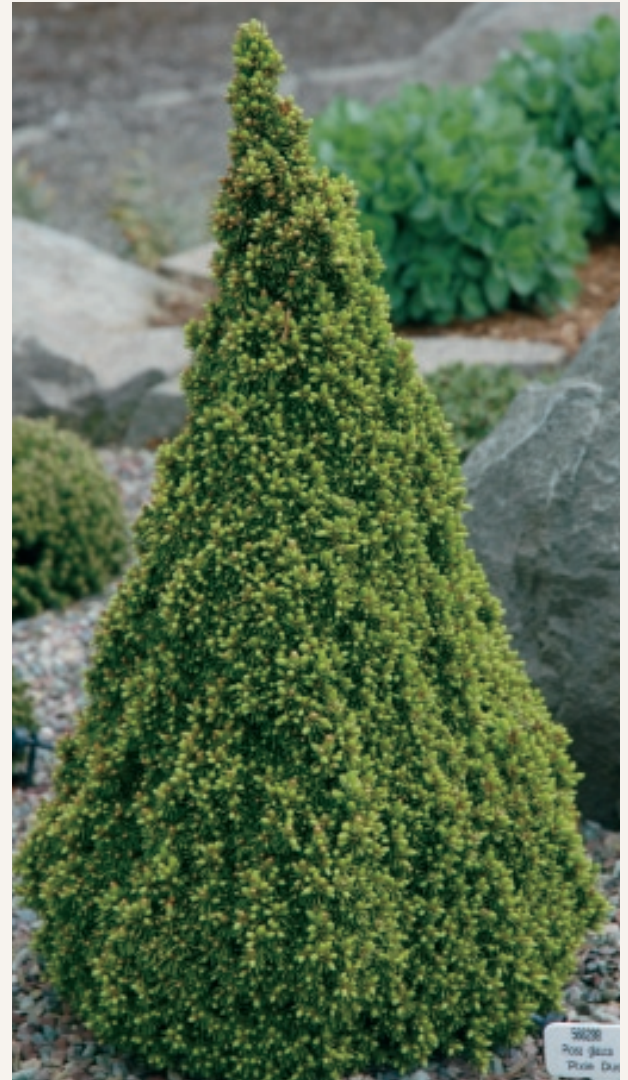
Picea glauca 'Pixie Dust', Pixie Dust white spruce