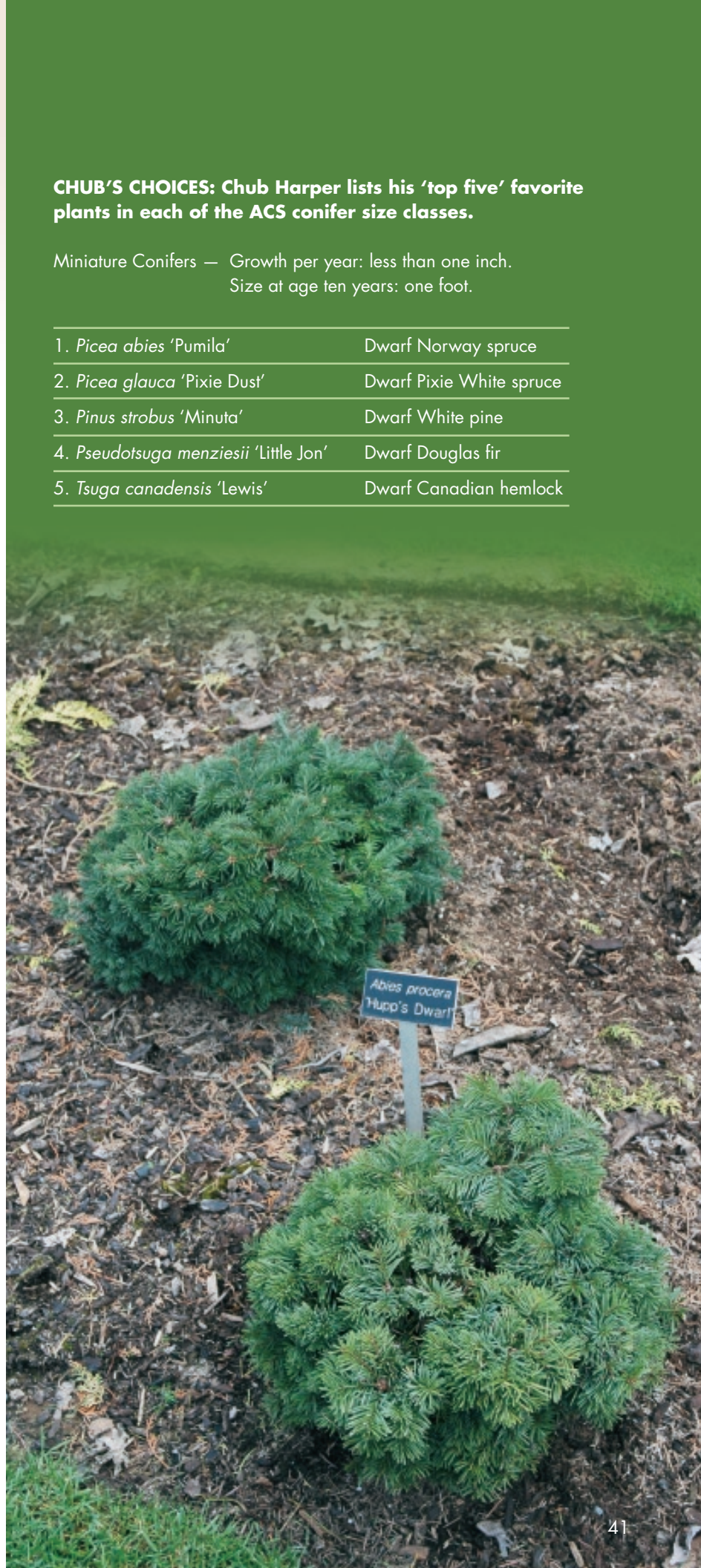
Little big men. These Abies procera 'Hupp's Dwarf', Hupp's Dwarf Noble firs may reach only 2 feet high at age 35. Abies procera trees in native stands in the Northwest can grow to over 240 feet at maturity.