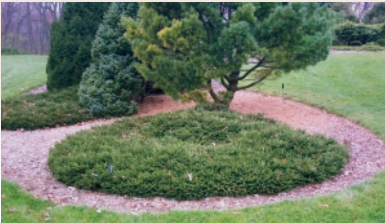
Picea abies 'Pumila', Dwarf Norway spruce

Picea abies 'Pumila'. This Norway spruce cultivar forms semi-prostrate mounds. Unlike many of the 'nest' forms of Picea abies , which tend to flatten out, Pumila maintains a rounded habit with shoots pointed upward. Conifer expert Chub Harper notes, "This is an outstanding versatile plant and it's tougher than a nail."