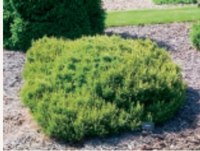
Pinus strobus 'Minuta', Dwarf white pine.

Pinus strobus 'Minuta'. Nice low mounding white pine with short needles. Prefers full sun.