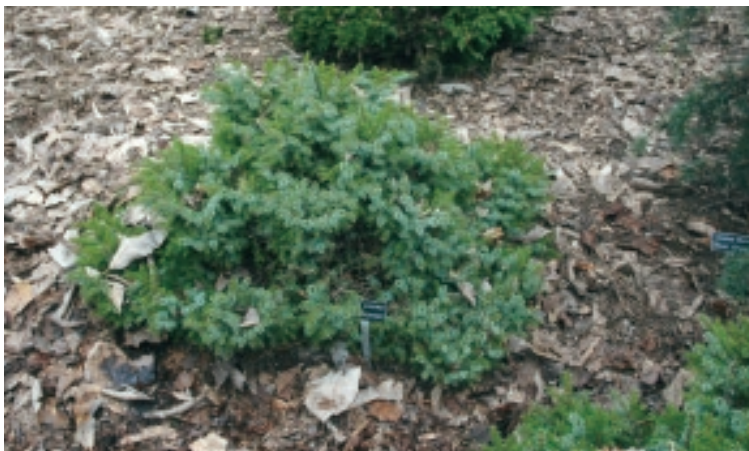
Picea omorika 'Guenter', Guenter's Serbian spruce

Picea omorika 'Guenter'. This plant is a very dwarf and dense conical plant with dark green needles that have silvery back sides. This plant is an excellent candidate for the rockery or other small garden. Cultivar may be listed as 'Hexebessen'.