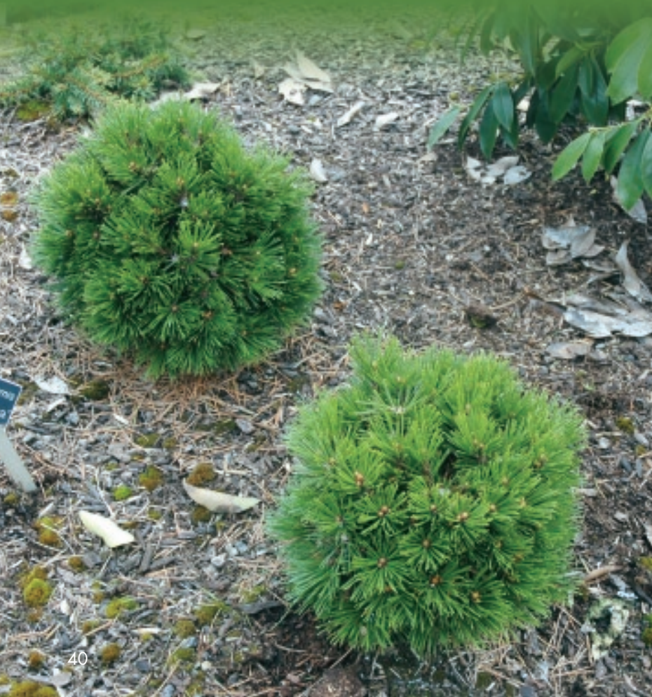
Pinus leucodermis ‘Beran Conica’, Beran’s Conical Bosnian pine

In this edition, we’ll start with the small end of the conifer spectrum and discuss miniature conifers . These are plants that typically have growth rates of less than one inch per year and may only reach two or three feet in height after three decades. Miniature conifers highlight the