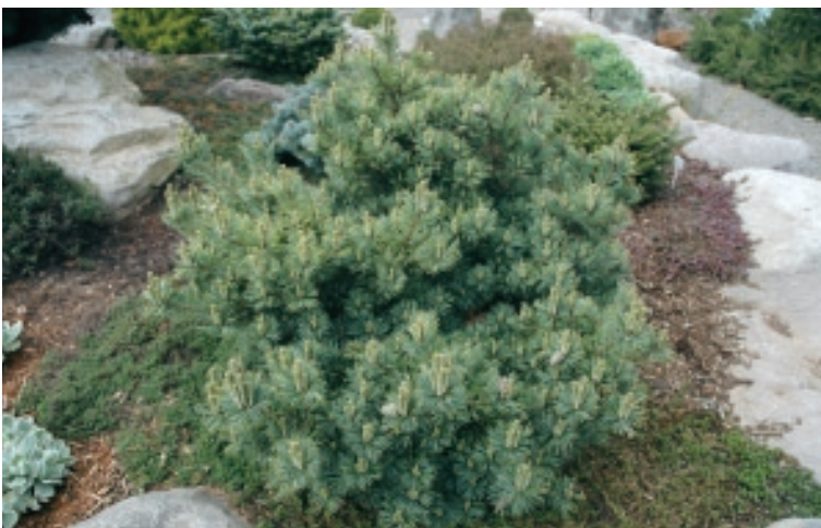
Pinus parvifolia 'Hagoromo', Hagoromo Japanese white pine

Pseudotsuga menziesii 'Little Jon'. This Douglas-fir is unusual in that it maintains a relatively upright form and is one of the slowest growing Douglas-firs reaching about 3 feet at age 20. This is a well-behaved plant with rich green color.