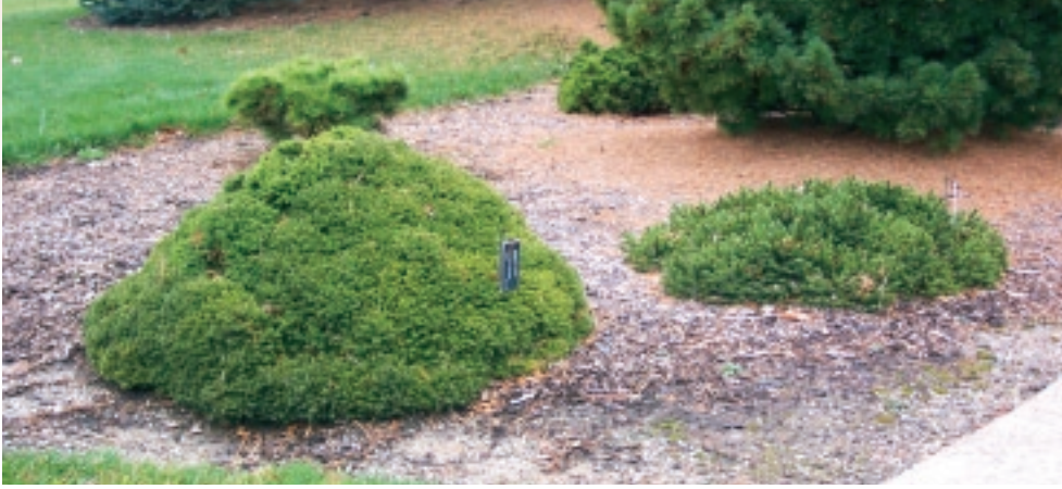
Miniature conifers such as Picea abies 'Little Gem' (left), Little Gem Norway spruce add contrast when planted near larger trees.