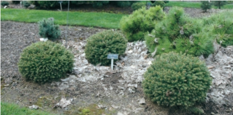
Picea abies 'Bant', Bant's Dwarf Norway spruce

Picea abies 'Little Gem'. This is a superb rock garden specimen. It was a witches' broom that had developed on P. abies 'Nidiformis', which itself was a witches' broom that had been found on a Norway spruce.