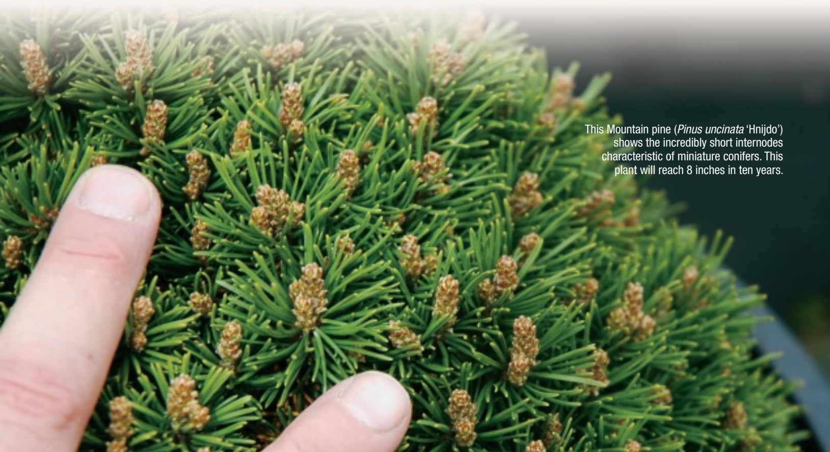
This Mountain pine ( Pinus uncinata 'Hnjido') shows the incredibly short internodes characteristic of miniature conifers. This plant will reach 8 inches in ten years.