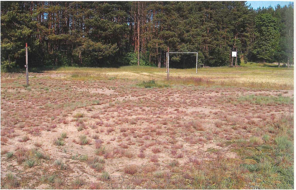
Fig. 2: Corniculario-Corynephorretum , typical subtype. Dry grassland seasonally used as a sports field in the village of Wymój, Masurian Lake District (July 2008).