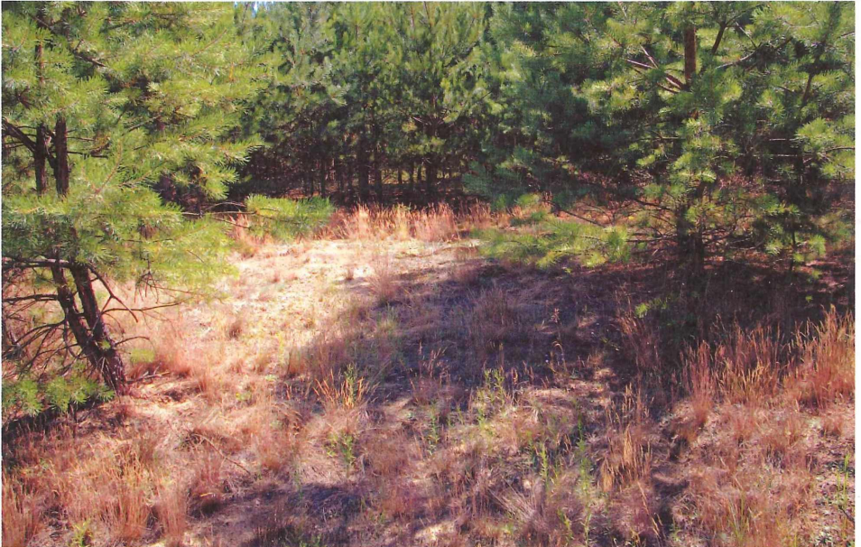
Fig. 3: Corniculario-Corynephorretum , typical subtype. Dry grassland overgrown with self-sown Pinus sylvestris – an example of natural succession – near the village of Wymój – Masurian Lake District.