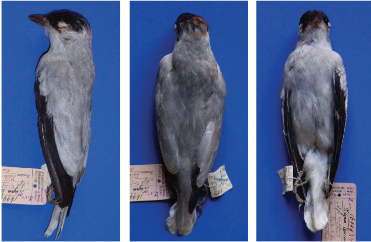
Figure 2 (left). Lateral view of the holotype of White-tailed Tityra Tityra leucura