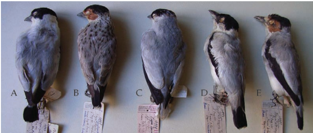
Figure 5. Dorsal view of males and females of Black-crowned Tityra T. inquisitor pelzelni (A and B) and T. i. albitorques (D and E), compared to the male holotype of White-tailed Tityra T. leucura (C) (E. Bauernfeind)