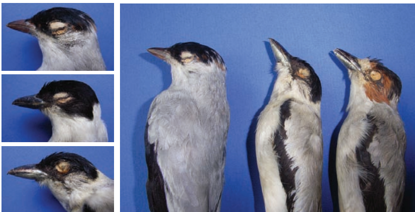
Figure 6 (left). Head views of the holotype of White-tailed Tityra T. leucura (top) and Black-crowned Tityra T. inquisitor pelzelni (middle) and T. i. albitorques (bottom)