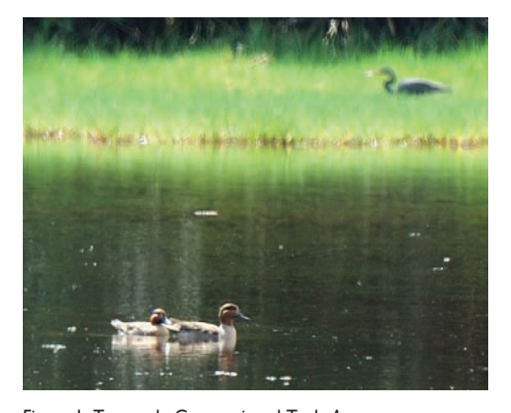
Figure 1. Two male Green-winged Teals Anas crecca carolinensis, Rémire-Montjoly, French Guiana, 26 November 2006

Two females were at the Lac du Bois Diable, Kourou, on 4-6 January 2006 (PS, JV, OT), and three males in eclipse plumage and two females, were at the same lake on 22-24 October 2007 (PS, JV, AV et al.). These observations are the third and fourth for French Guiana. The first record was at the Lac du Bois Chaudat, Kourou, on 12 January 1994 (AD, PD) and the second at Larivot in Matoury, near Cayenne, on 3 November-4 December 1999 (GEPOG).