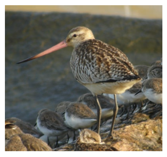
Figure 3. Bar-tailed Godwit Limosa lapponica, Kourou, French Guiana, 7 November 2007

An immature was photographed at the estuary of the Kourou River on 7–8 and 15 November 2007 (AV, TP; Fig. 3). This observation is the first for the Guiana Shield and the fourth documented record for continental South America, following singles photographed in Venezuela in 1985<sup>14</sup> and two separate records in north-east Brazil in 2006<sup>6</sup>. There is also one documented and several sight-only records from Brazilian offshore islands<sup>23</sup>.