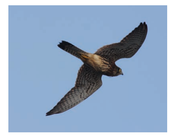
Figure 2. Adult female Common Kestrel Falco tinnunculus , off Awala-Yalimapo, French Guiana, 27 December 2007 (L. Ponge)

One was seen at Trésor Nature Reserve on 16–29 January 2006 (KP, OT et al.), an adult was photographed at Roche Tablon along the N2 road on 12 March 2006 (ND, TL), an adult was at Camp Patawa, on the Montagne de Kaw, on 9 December 2006 (FE, BG, TL), and an adult was photographed at the Carrefour Eskol, also on the Montagne de Kaw, on 10 December 2006 (TL, BV). Two were photographed at the village of Saül on 2 December 2007 (TD, OC). Montagne de Kaw is a favoured wintering site in French Guiana. Only ten observations are known for Surinam, all from the Brownsberg Nature Reserve in November–March.