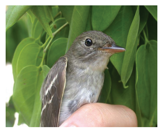
Figure 8. Willow / Alder Flycatcher Empidonax traillii / alnorum, Awala, French Guiana, 5 November 2005 (A. Renaudier)

One was tape-recorded along the Crique Limonade near Saül, at its confluence with the Crique Cochon, on 6 December 2007 (OC, TD). This jay is surprisingly rare in French Guiana, where it occurs