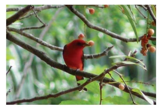
Figure 10. Male Scarlet Tanager Piranga olivacea, Awala-Yalimapo, French Guiana, 15 April 2007 (M. Dechelle)

A male was photographed at the Ranch Terre Rouge, near Mana, in late November 2006 (JR;