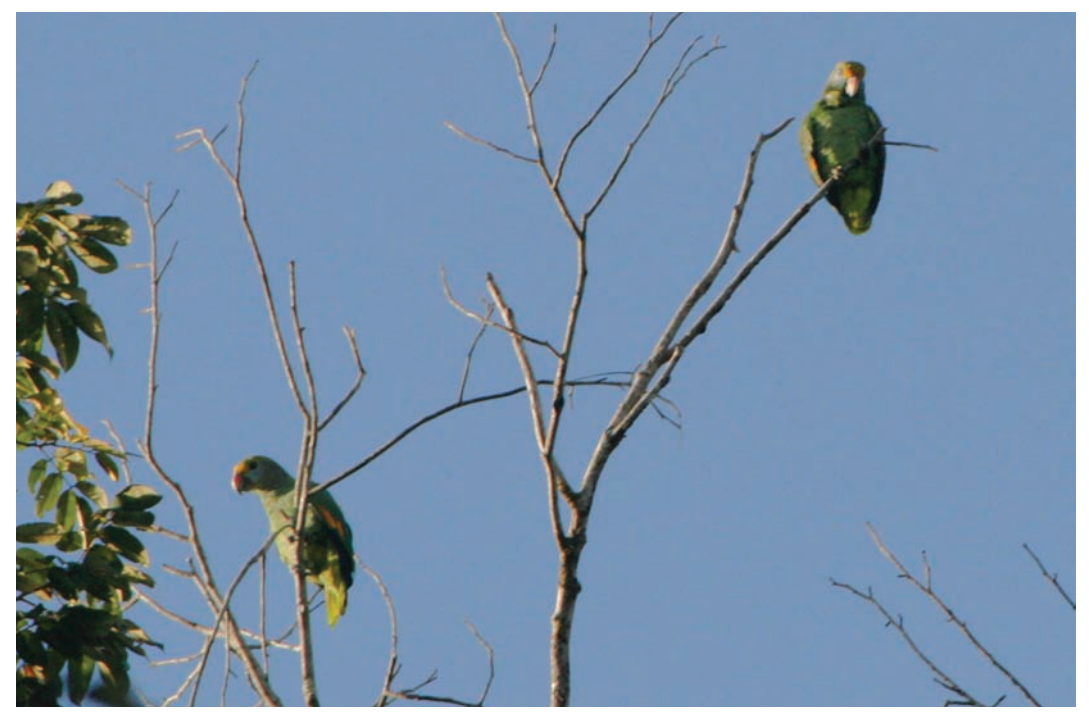
Figure 4. Blue-cheeked Parrot Amazona dufresniana, Crique Limonade, Saül, French Guiana, 12 December 2007 (O. Claessens)

(AV). This is the second record for French Guiana, and its location is surprising. The first was made at Monpésoula, on the Haut Marouini River, in December 1999 (O. Tostain pers. comm.).