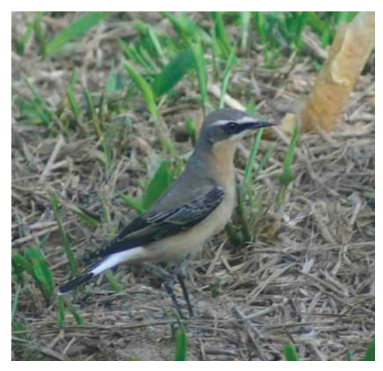
Figure 9. Male Northern Wheatear Oenanthe oenanthe leucorhoa , Kaw, French Guiana, 20 November 2006 (F. Brochard)