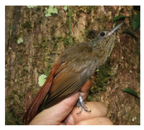
Figure 6. Female Spot-throated Woodcreeper Deconychura stictolaema, Trinité Nature Reserve, French Guiana, 16 October 2007