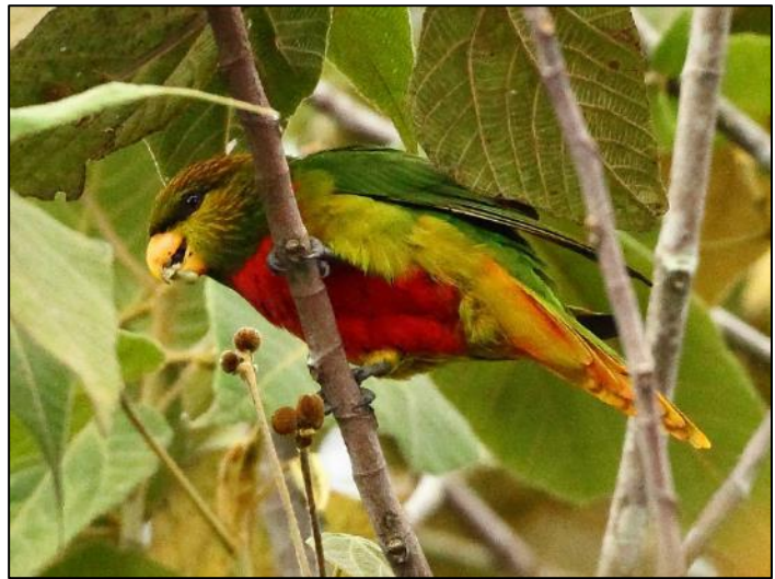
Yellow-billed Lorikeet by Markus Lilje

Other delights in the lodge grounds included the gorgeous White-bibbed Fruit Dove, Rufous-throated Bronze, Glossy Swiftlet, Yellow-billed Lorikeet, Common Smoky Honeyeater, Yellow-browed Melidectes, Great Woodswallows - huddling together in the cool of the morning, Mountain Peltops, Papuan Sitella, Willie Wagtail and Black-sided Robin. The taxing waterfall trail alongside the lodge was surprisingly quiet, although we did get looks at Sclater's Whistler, Slaty Robin and Torrent-lark in between negotiating a variety of ingenious suspension bridges. A spotlighting expedition at the lodge revealed not our intended targets (Papuan Boobook or Sooty Owl) but rather a massive Rufous Owl that sat in the same position for over an hour, allowing everyone good views and pics. This was a first on any Rockjumper tour and probably one of the first records for the area!