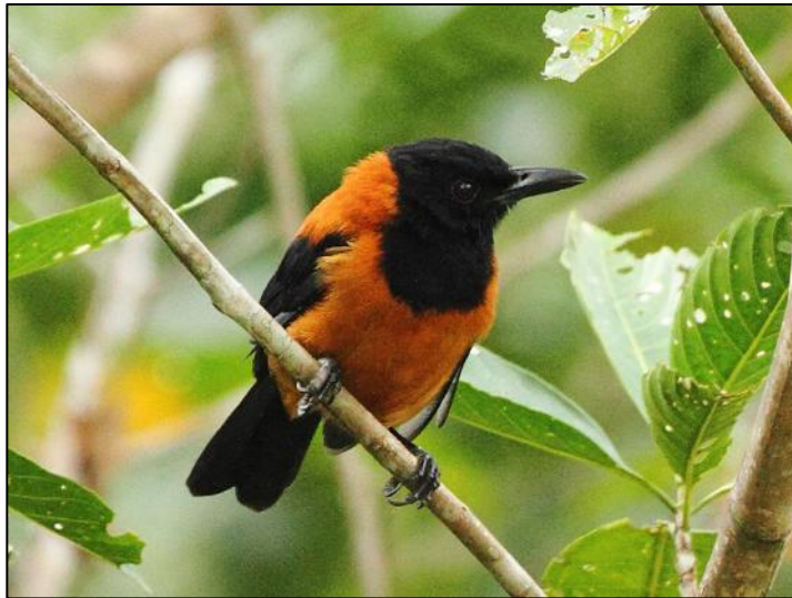
Hooded Pitohui by Markus Lilje

some trees to see if anything would peek out of hollows higher up the trunks. On our first try, a Sugar Glider climbed up to the rim and peered down at us for a little while!