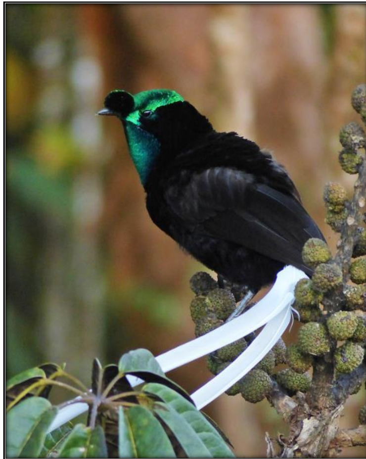
Ribbon-tailed Astrapia

25 th July to 10 th August 2016 (18 days)