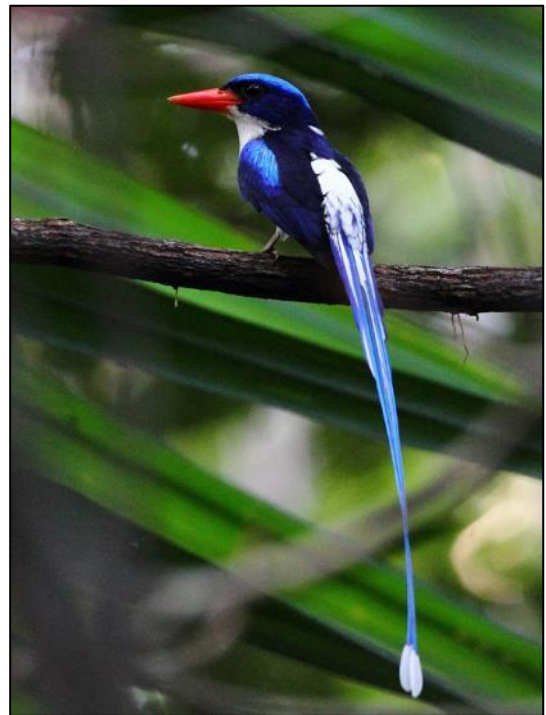
Common Paradise Kingfisher

The steamy lowland rainforest houses a number of tough kingfisher species. We managed to track down a lovely Common Paradise Kingfisher but Hook-billed and Little Paradise Kingfishers remained elusive, despite them calling tantalisingly close. Blue Jewel-babbler was equally tough and was only seen by a couple of people, while everyone had good views of Southern Crowned Pigeon in all its glory. But even all of these amazing birds were outshone by our sighting of a rare New Guinea Flightless Rail that poked around a chopped sago palm while a beautiful (Mangrove?) monitor lizard hovered close by. On the day that we left the fishing camp, we set out early to maximise the coolness of morning and were greeted by a magical sight. All around us, hundreds of thousands of white mayflies danced over the surface of the water in a scene worthy of Disney's Fantasia . We passed through this sublime performance for a kilometre or two before pulling up to the bank and heading into the forest. When we returned a couple of hours later they had all gone – we were lucky to have witnessed the beautiful event when we did.