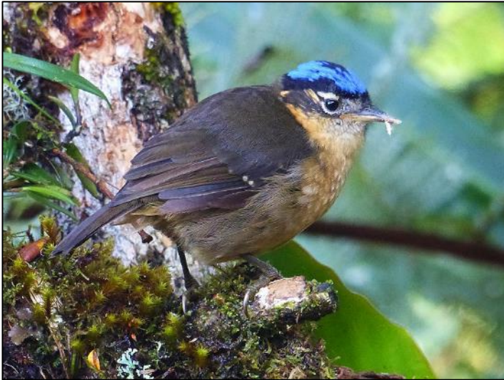
Blue-capped Ibrit by Wayne Jones

Those perfect, silky arctic-white tail feathers really are something to behold up close!