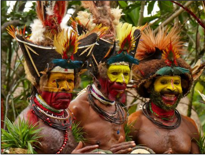
Huli Wigmen

and friendly Rhinoceros Beetles added to the spectacular arthropod array.