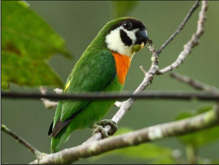
Orange-breasted Fig Parrot

a bright orange-yellow bill gave away the location of this otherwise cryptically coloured bird.