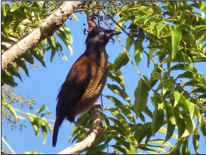
Lawes's Parotia by Wayne Jones

of the main attractions and any spare moment was usually spent waiting to see what would turn up next. In under an hour on one morning, we recorded eight species of BOP, many of them in the tree at the same time!