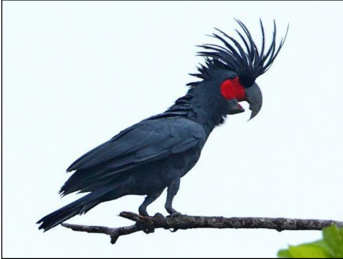
Palm Cockatoo by Markus Lilje

famously hoisted up a tree to spy on birds-of-paradise.