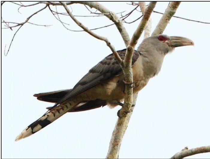
Channel-billed Cuckoo by Markus Lilje

We saw no less than three Twelve-wired Birds-of-paradise, one of which performed his little jig up and down his display perch! One of the pure joys of visiting PNG's lowland forest has to be the sound of a huge Blyth's Hornbill flapping in slow motion overhead. We were fortunate to see and hear good numbers of these fabulous birds along with massive Palm Cockatoos, which gave themselves away with their shrill squawking. Other species included Great Egret, Pacific Baza, a Grey-headed Goshawk displaying alongside an unperturbed pigeon, White-bellied Sea Eagle, Stephan's Emerald Dove, Beautiful, Superb and Dwarf Fruit Doves, Pinon's, Zoe's and Collared Imperial Pigeons, Pacific Koel, marvellous Pterodactyl-like Channel-billed Cuckoo, Little