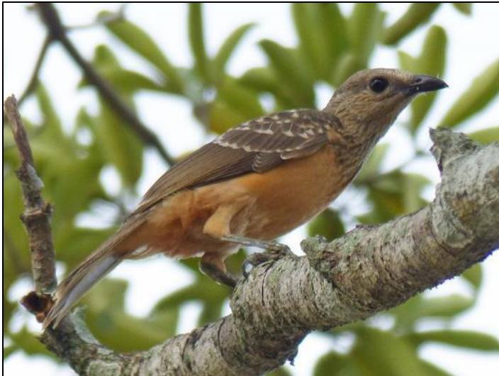
Fawn-breasted Bowerbird

The Papua New Guinean capital of Port Moresby served as the kick-off point for our tour of this fabled country. We made our way across town to the grounds of the Pacific Adventist University (PAU) where a pair of rapidly drying ponds held a wealth of waterbirds. Handsome Comb-crested Jacana, Australasian Swamphen and Dusky Moorhen provided wonderful photo opps as they wandered to within metres of us. Wandering Whistling and the scarcer Plumed Whistling Ducks were not quite as bold and opted to stick to the middle of the water. Pacific Black Duck, Pied Heron, Intermediate and Great Egrets, Australasian Grebe, Little Pied and Little Black Cormorants and Nankeen Night Heron were also seen around the waterbodies. In