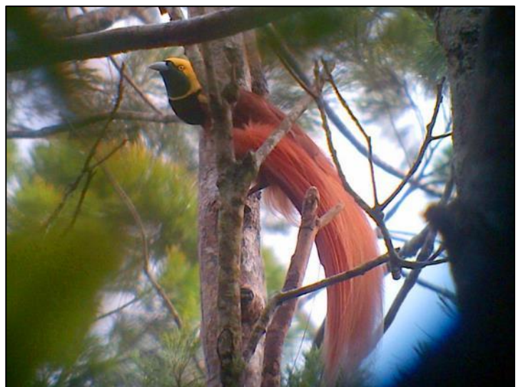
Raggiana Bird-of-paradise by Wayne Jones

Our visit to Varirata National Park the following day began with an early morning visit to the Raggiana Bird-of-paradise lek site – managing to spot a Grey Dorcopsis as it dashed across the road! Pulling up at the lek, we could already hear the male Raggianas excitedly squawking so we quickly made our way to the action. There were at least four displaying males and they all went hysterical whenever a female came past, prostrating their wings and fluffing up their fabulous ruddy flank plumes. What a sensational introduction to PNG’s most famous bird family!