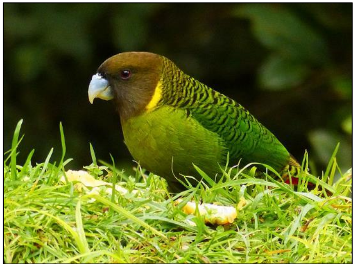
Brehm's Tiger Parrot

At the end of our time around Tari, we bussed our way to Kumul Lodge near Mt Hagen, climbing and dropping as we passed through spectacular terrain, cut by numerous gorges and imposing peaks. It was a long drive so we didn't stop to bird, only picking up chance Brown Falcon, Hooded Mannikin and a glimpsed Spotless Crake along the way. That afternoon, the deck overlooking the feeding platform at Kumul made a welcome change from being on the bus all day. Visitors to the platform that would become very familiar to us over the next few days included the world's plumpest Brehm's Tiger Parrots, Grey-streaked Honeyeater, Rufous-naped Whistler, female Ribbon-tailed Astrapias, a female Brown Sicklebill, Friendly Fantail, cute White-winged Robin, Island Thrush, Common Smoky Honeyeater and the ubiquitous Belford's Melidectes. Another garden denizen was a spectacular male Ribbon-tailed Astrapia, which we saw a number of times during our stay and which gave some sensational views.