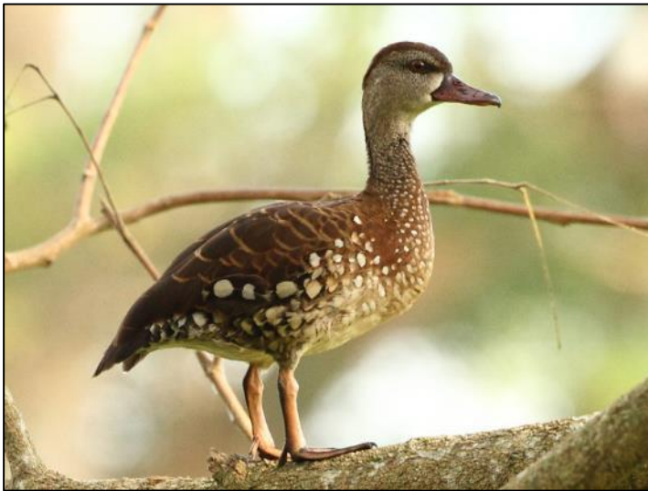
Spotted Whistling Duck by Markus Lilje

Back in the capital, we ventured along the often bumpy but never dull road past Brown River to the Hisiu River Mouth and Hisiu Lake. The road revealed a good mix of Australo-Papuan species, including a very brief Orange-footed Scrubfowl, Variable Goshawk, a stunning male Papuan Harrier that quartered back and forth across a small field right next to the road, Whistling Kite, Torresian Imperial Pigeon, Pheasant Coucal, Channel-billed Cuckoo, Blue-winged and Rufous-bellied Kookaburras, immaculate Forest Kingfisher, Red-flanked Lorikeet, Red-cheeked and Eclectus Parrots, White-shouldered Fairywren, Black-faced Cuckooshrike, Grey Shrikethrush, Torresian Crow, a male Raggiana BOP which flew level with the bus for a few metres, Golden-headed Cisticola, Singing Starling and Grey-headed Mannikin. At the river mouth and lake areas, we finally found Spotted Whistling Duck, along with its Wandering cousins, Green Pygmy Goose, Australasian Grebe, Little Egret, Australasian Darter, White-bellied Sea Eagle, Australasian Swamphen, Dusky Moorhen, Comb-crested Jacana, at least 20 Bar-shouldered Doves, Rufous-banded Honeyeater, Australian Reed Warbler, dozens of Olive-backed Sunbirds and Chestnut-breasted Mannikin, Pacific Reef Heron, Whimbrel and Gull-billed and Greater Crested Terns. We even added a mammal to our list – an Agile Wallaby that bounded away but then turned and watched us for a while so that everyone could get a nice look at his handsome face!