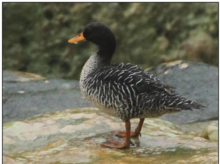
Salvadori's Teal