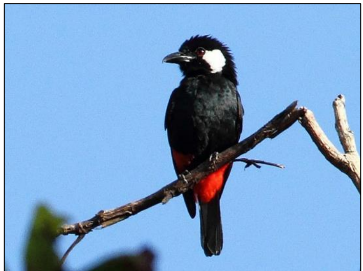
Lowland Peltops by Markus Lilje

We naturally visited the tree and paid homage to the great naturalist – but only after sampling the delights that attracted Attenborough to the spot in the first place. High in the canopy, in its favourite tree, a male King BOP tested the limits of warbler-neck but ultimately gave us excellent views. We even managed to see those famous spiralled green discs at the ends of its tail wires. But he was just the opening act. The main performance took place further along the trail where ten male Greater BOPs and two male Raggiana BOPs whipped themselves into a feathery frenzy every time a couple of females happened past. We even witnessed the creation of future BOPs! We watched, absorbed, for ages... it wasn't a surprise when this species