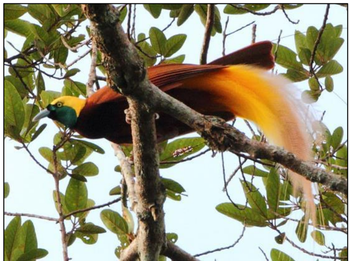
Greater Bird-of-paradise

Tabubil’s other prime birding spot is Dablin Creek, a steep, gravelly pipeline road that provided access to the mid-altitude forest that we visited on two occasions. We concentrated our efforts on a couple of fruiting trees and a lovely Albizia -like tree that attracted its fair share of specials. The birding was often slow but this was more than compensated for by the quality – a quartet of uncommon honeyeaters: Green-backed, Spotted, Long-billed and Puff-backed Honeyeaters, Obscure Berrypecker, Mountain Peltops, Variable Goshawk, Amboyna Cuckoo-Dove, White-eared Bronze Cuckoo, Long-tailed Honey Buzzard, Red-breasted Pygmy Parrot, six Pesquet’s Parrots, Orange-breasted Fig Parrot, Red and Papuan Black Myzomelas, Green-backed Gerygone, a male and two female Queen Carola’s Parotias quite far off, Stout-billed, Grey-headed and Golden Cuckooshrikes, Black-winged Monarch and Crinkle-collared Manucode. One of the prime targets in the Tabubil area was the Magnificent Bird-of-paradise. We slowly improved on our sightings, starting with two females during our first outing to Dablin Creek. This was followed by more looks at the blue-billed females the following day, until finally, we had excellent scoped views of the yellow and blackish-green male and his curlicue tail.