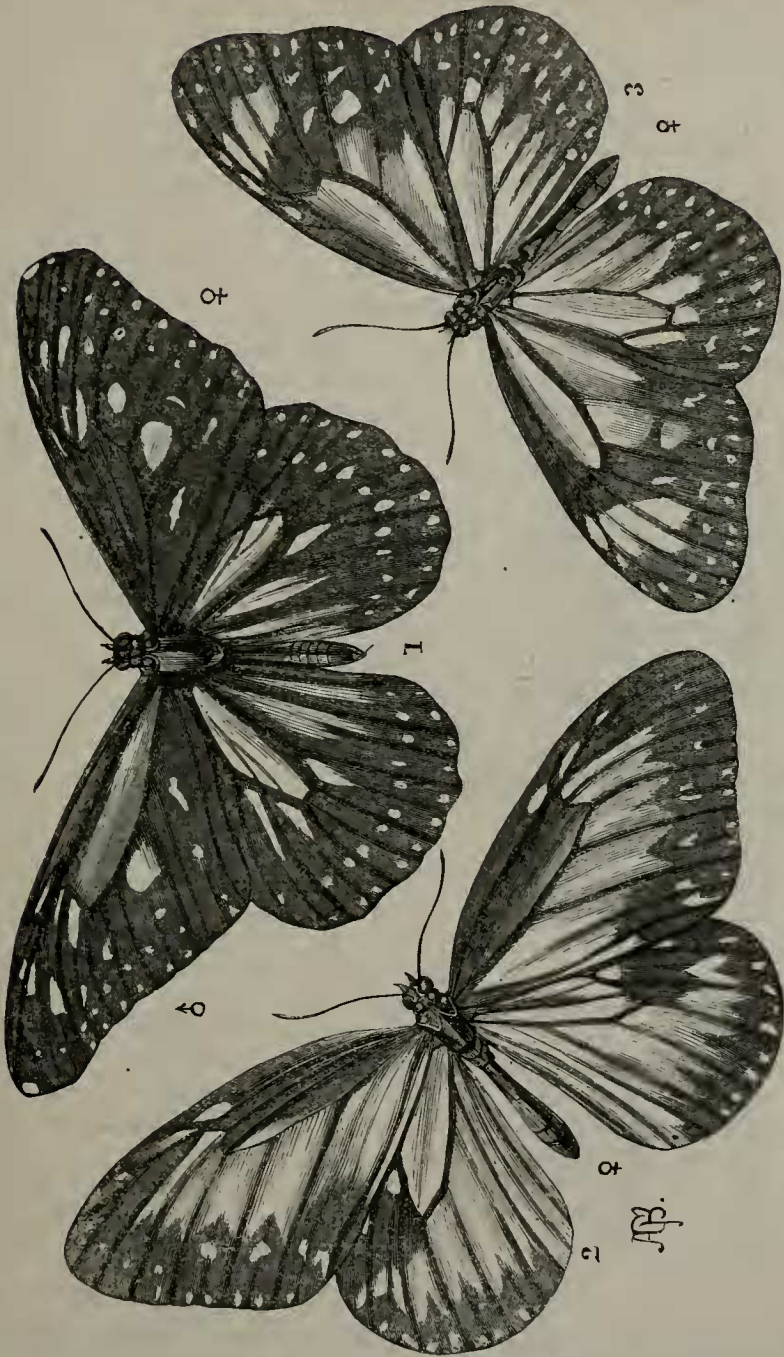
Fig. 1. Danais ismare (Cramer), hermaphrodite. 2. — salvini . 3. — lutescens .