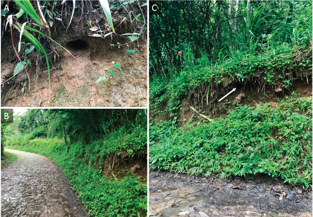
Figure 2. Nest entrance (A) and partial view of the nest site (B–C) of Ceará Leaf Tosser Sclerurus cearensis , Catolé, Ceará, Brazil, June 2020 (Cecília Licarião)