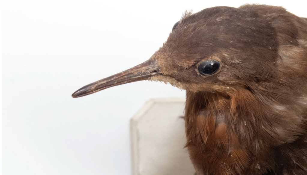
Figure 3. Tahiti Sandpiper Prosobonia leucoptera , RMNH.AVES.87556; note the minimal supercilium in this species, and the pale bill base