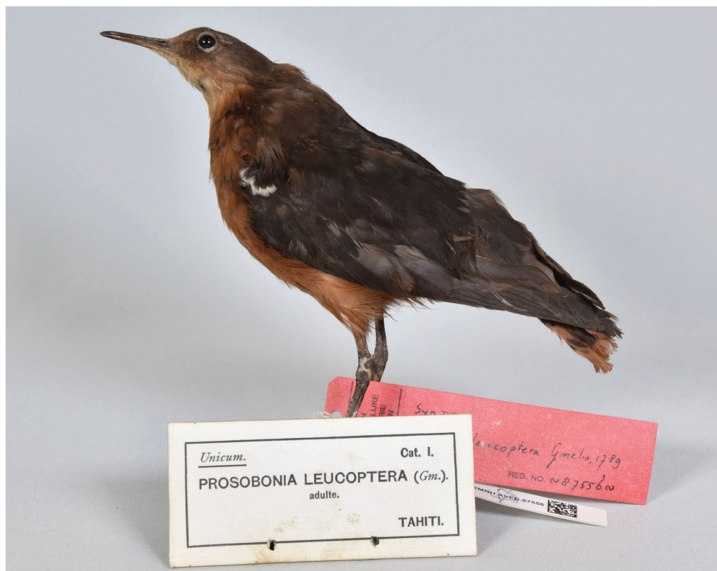
Figure 4. Tahiti Sandpiper Prosobonia leucoptera , RMNH.AVES.87556; note the pale head compared to Fig. 1