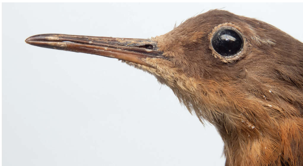
Figure 2. Tahiti Sandpiper Prosobonia leucoptera , RMNH.AVES.87556; note the gap in the bill, the shape of the nostrils, and the feathering on the mandible

tertials. Wings level with the tail tip. Head: russet-coloured from submoustachial region to breast. Bill base, throat and part of lores buff. Narrow eye-ring also buff. A small curved supercilium partially coloured (buff-)white (5–6 feathers) behind the eye. Crown, hindneck and neck-sides pale sooty brown. Upperparts: upper mantle similar to hindneck, sooty brown, lower mantle and back dark sooty brown, and rump and uppertail-coverts russet / ferruginous (like underparts). Underparts: breast to undertail-coverts russet-