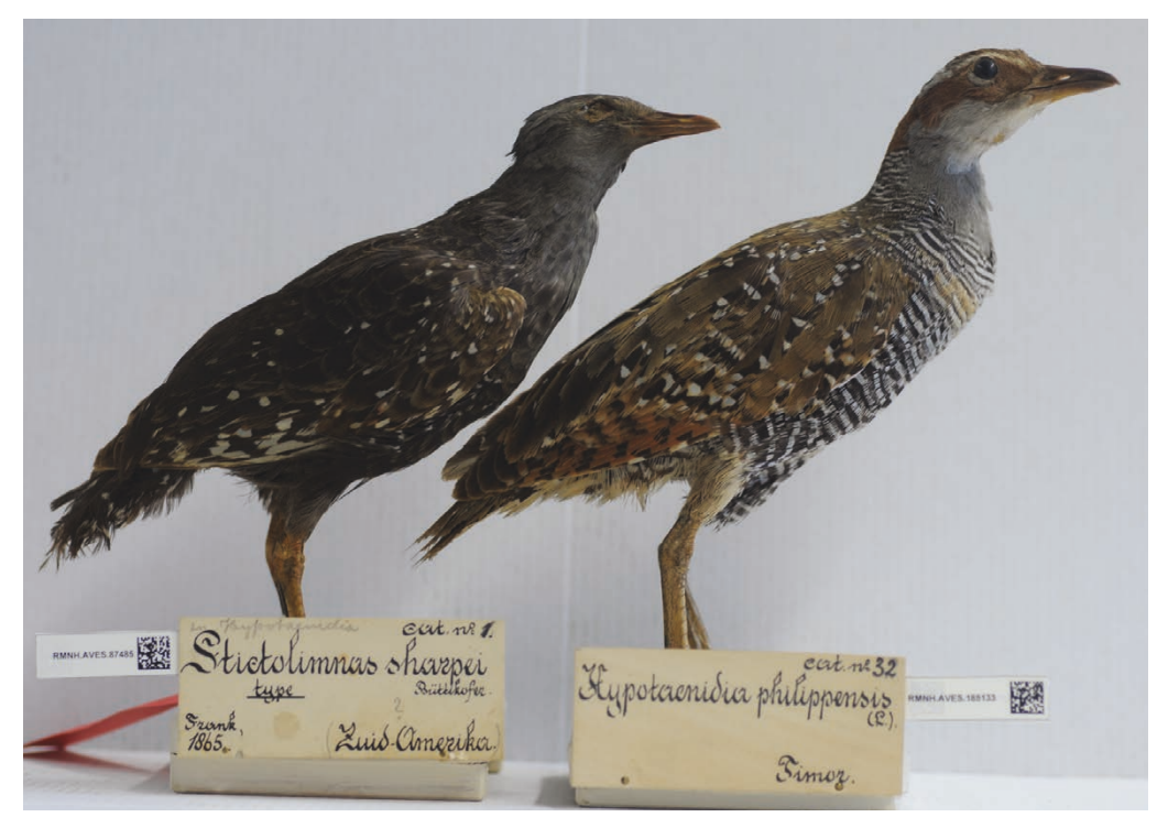
Figure 3. Sharpe's Rail Gallirallus sharpei RMNH 87485 (left) exhibiting category 3 melanism compared with a normal-coloured Buff-banded Rail G. philippensis RMNH 185133 (right)

feet reddish. Sharpe's Rail lacks the chestnut-coloured nape and ocular stripe, ochraceous pectoral band and pale superciliary of Buff-banded Rail (Fig. 3).