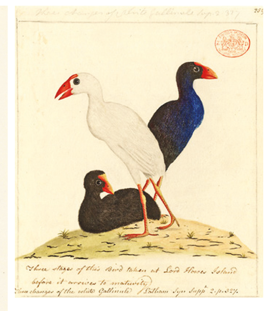
Figure 1. Watercolour of live Lord Howe Gallinules Porphyrio albus showing the various stages of progressive greying discussed in the text. Fig. 1a (left) shows a pair exhibiting the same colour aberrations as the extant specimens; illustration by George Raper c. 1790 (from Hindwood 1940). Fig. 1b (above) shows the three colour stages described by White (1790); illustration by Thomas Watling c. 1792 (from Fuller 2000).