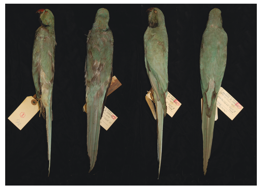
Figure 5. The two extant specimens of Rodrigues Parakeet Psittacula exsul exhibiting the parblue aberration. Male UMZC18/Psi/67/h/I (right) lateral and dorsal views; holotype female UMZC18/Psi/67/h/I (left) lateral and dorsal views (Julian P. Hume).

Palaeornis exsul. I saw one specimen of this bird as I was going from my camp to a distant cavern: unfortunately I had not my gun with me or I could easily have shot it as