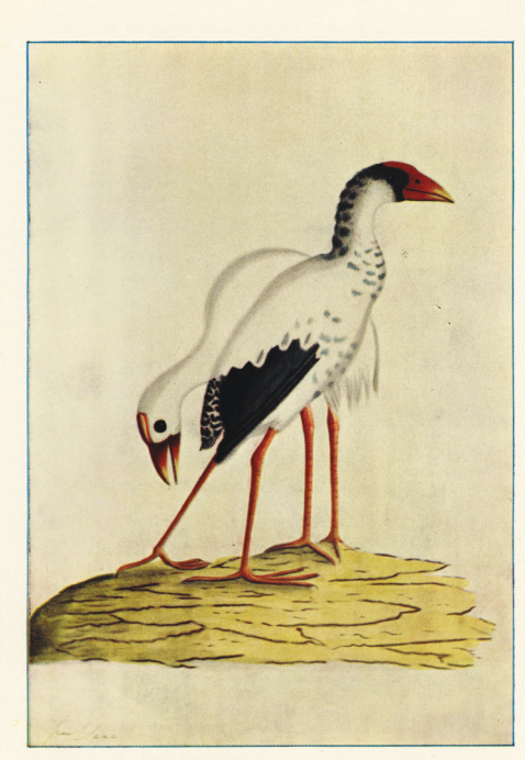
White Gallinule (Porphyrio albus albus) Painting no. 22 (circa 1790, artist unknown) in a collection of original drawings in the Alexander Turnbull Library, Wellington, New Zealand.

The first illustration was probably by Arthur Bowes Smyth, surgeon on one of the First Fleet vessels, the Lady Penrhyn , which arrived at Lord Howe on 16 May 1788 (Hutton 1991). The drawing depicts one white and two pied gallinules, and Smyth described the birds as 'some white, some blue and white, others all blue'. Other contemporary images demonstrate that the species was variably coloured, with some completely white, others white with blue speckling, some entirely blue. Phillip (1789) described the adult female