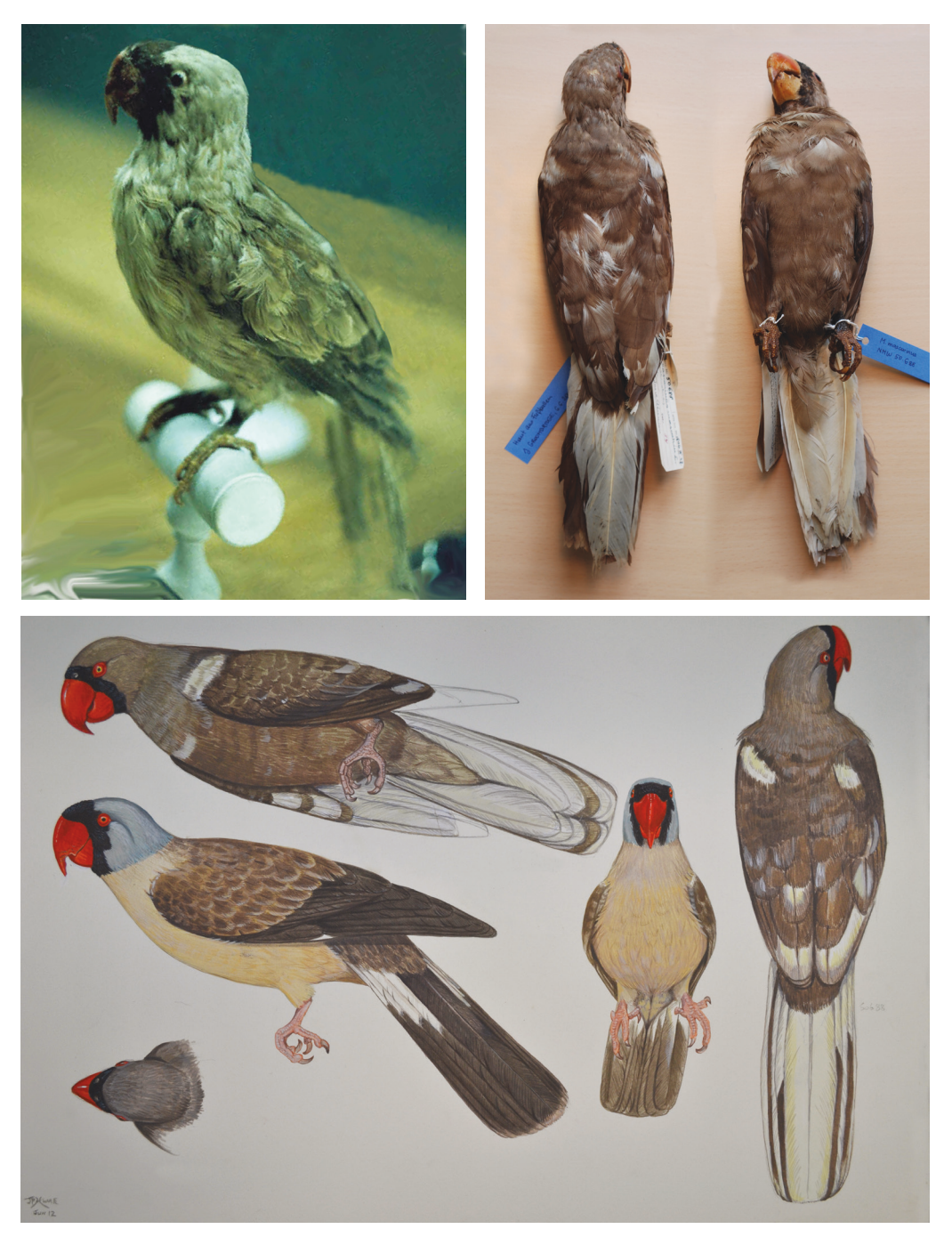
Figure 6. The two extant specimens of Mascarene Parrot Mascarinus mascarinus : Fig. 6a (top left) holotype MNHN 211 (Julian P. Hume); Fig. 6b (top right) NMW 50.688, dorsal and lateral views (Julian P. Hume); Fig. 6c (below) illustration of both specimens, drawn to scale (Julian P. Hume). The greyish-blue head of the Paris holotype (centre left and centre) is not discernible in the Vienna specimen, and the tail has been reconstructed. The irregular white feathering in the Vienna skin is due to poor diet in captivity.