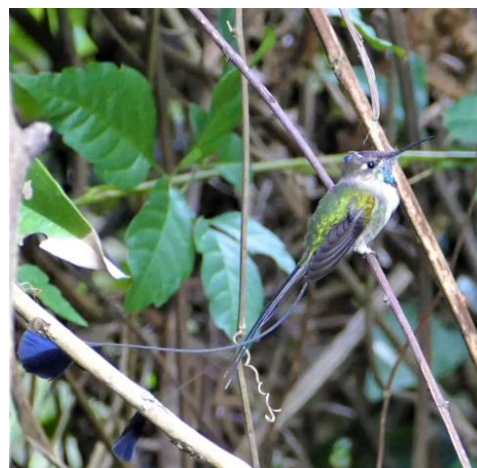
A male Marvellous Spatuletail

Our final destination that day was another pleasant hotel at Puerto Pumas, close to Lake Pomacochas. Sufficient daylight allowed us to approach the edge of the lake along a boardwalk. We arrived during a festival so it was busy and noisy. However this didn't seem to bother the birds and we saw Puna Snipe in an area of wet meadow, Plumbeous Rail which seemed to chorus with the local disco music, Peruvian Meadowlark and a flock of Yellow-bellied Seedeaters.