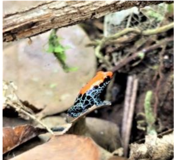
Poison Dart Frog