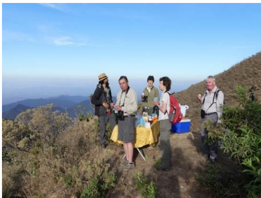
Tumbesian breakfast with a view

We agreed to depart the hotel at 4am in order to cross the Andes and bird in the Tumbesian region on the western slopes as early as possible. A delicious al fresco breakfast was provided before we explored the dry slopes, finding Chicungo, Andean Slaty Thrush, Tumbesian Tyrannulet, Black-cowled Saltator, Green-tailed Trainbearer, Chapman's Antshrike, Ash-breasted Sierra Finch, Rusty Flowerpiercer, several difficult Ecuadorean Piculets and Bay-crowned and White-winged Brush Finches. We were treated to the wonderful spectacle of an adult Andean Condor gliding overhead against the blue sky!