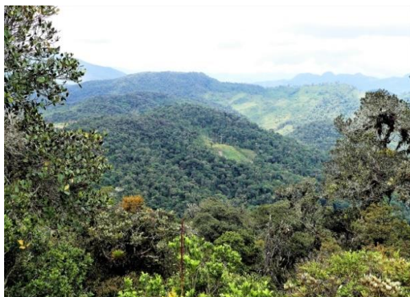
The Cloud Forest of Abra Patricia

Owlet Lodge is in a beautiful location amongst an extensive tract of cloud species on the eastern slope of the Andes at an altitude of about 2300 metres. The forest here is rich in bird and other wildlife. In the morning, we birded in the grounds of the eco-Lodge and also from the road, but a persistent drizzle kept the birds down.