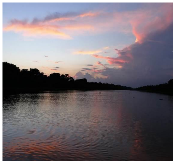
Sunset over the River Amazon

Our third morning at Muyuna Lodge began with a trip up the Yanuyacu River to try and track down the rare Wattled Curassow. We caught a glimpse of the elusive Capybara on the way. Dense water weed necessitated Moses having to chop a way through until it became just too thick and we had to climb out onto the bank. We walked for about half a mile along the forest edge until our target bird was spotted high in the canopy. After much straining of necks, three birds were located - two males that were seen to fly off and a female that remained long enough for all to get reasonable views – fabulous! Other birds of note included Speckled Chachalaca, Black-tailed Trogon and a Lettered Aracari. We were treated to four more Woodpeckers: Yellow-tufted, Spot-breasted, Chestnut and Cream-coloured, as well as four more Woodcreepers: White-chinned, Long-billed, Striped and Elegant.