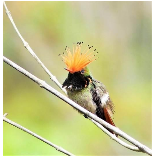
The charismatic Rufous-crested Coquette

The top mammal sighting was almost unanimously the Pink River Dolphin.