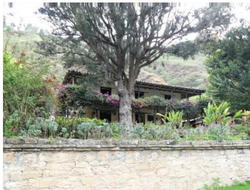
The delightful Homestead of El Chillo

We then had a 36 kilometre uphill drive along a twisty mountain, mostly gravel, road to the ancient archaeological site of Kuelap, built by the Chachapoya people in the 16th century. We had a packed lunch at the site, and then proceeded up to the fortress with a guide where we learned a lot about the hill fort and its people. There were birds to be seen here, and on the road out too, including Scarlet-fronted Parakeet, Red-crested Cotinga, Banded Fruiteater, Hooded Siskin and the lovely Rainbow Starfrontlet – sadly we were only able to see its back. It was well worth the trip up to the ruins but a rain shower made descending the polished