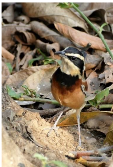
A confiding Elegant Crescentchest

Whilst still dark, we drove to Casupe, a mountainous region inside the reserve, spotting a Peruvian Thick-knee and Scrub Nightjars on the way. We had breakfast by a small shrine and birded on the dry western Andean slopes. New birds included Red-masked Parakeet, a flyby pair of Ochre-bellied Dove, White-collared Swift, Plumbeous-backed Thrush, Grey-and-Gold Warbler, Pacific Elaenia, Tumbes Pewee, Black-capped Sparrow and a gorgeous Ecuadorian Trogon perched quietly in the trees just above our breakfast spot. A family of four King Vultures was seen wheeling around in the valley. In the afternoon, back at the Lodge, we finally got to see the Elegant Crescentchest which was very obliging for the photographers. Many flycatchers, antshrikes and other small birds were seen during the day, mostly coming to drink at the small water hole by the Lodge. At dusk, a West Peruvian Screech Owl was located in a nearby tree, typically well-camouflaged!