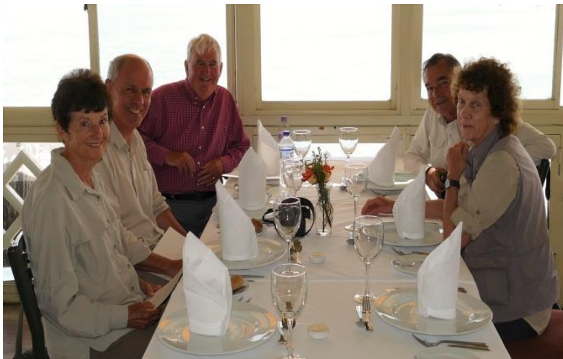
The 2016 Naturetrek Northern Peru Group enjoying their 'end-of-tour' lunch

On our final day of the trip, we departed from Chiclayo airport for Lima. Here, we were able to indulge in a spot of sea-watching, which gave us, among others, Peruvian Booby, Guanay and Red-legged Cormorants, Royal Tern and a couple of Humboldt Penguins. Afterwards, we drove to a small pool on a private estate and 'collected' some more water birds, including Purple Gallinule, a flock of Black Skimmers, many Little Blue Herons and several gull species including Band-tailed and Franklin's. We were treated to a wonderful 'end of tour' seafood lunch overlooking the sea where we could watch lovely Inca Terns coming and going. All too soon it was time to leave for the airport and our homeward flights.