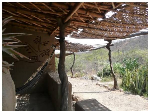
Rustic eco- accommodation at Shaparri

Before breakfast, we walked a short distance to observe hummingbirds drinking and bathing in the nearby creek. Several more varieties were added to those already seen at Chaparri, including the endemic Tumbes Hummingbird. After breakfast it was, sadly, time to leave, but not before adding Sulphur-throated Finch and Parrot-billed Seedeater to our increasingly impressive list. Chaparri is a wonderful place where dedicated biologists are doing important work on reintroducing rare species back to the wild – we wish them well.