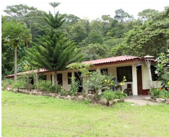
The peaceful lodge at Wakanki

We arrived at the Lodge on the Abra Patricia ridge at dusk and were told it was the best time to try for the Long-whiskered Owlet. It meant climbing down a tricky path for about a mile and a half armed with torches and with the help of the local guide. A pair of White-capped Tanagers was spotted in the top of a nearby palm. Once in the correct location, we tried to tempt the Owlet to show itself. Initial signs were good as almost immediately an individual called. It clearly came much closer, but a further 30 minutes or so later we still had not seen it and it was decided we should return to the Lodge.