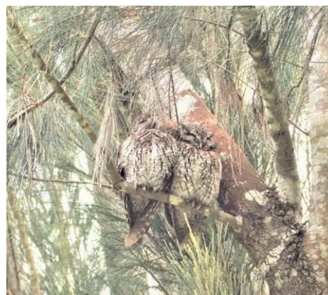
Roosting Koepcke's Screech-Owls