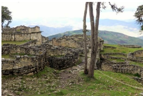
Ruins of circular buildings at Kuelap Hillfort

After some quick birding around the hotel where we picked up Golden-bellied Grosbeak, Andean Lapwing, Rufous-capped Antshrike, Tufted Tit-tyrant and our first Peruvian Pigeons, we set off for the Utcubamba River valley. The birds here are increasingly regarded as Marañon specialties and the day, which had started cool and overcast, became hotter as the terrain became drier. Several stops were made in the valley for Marañon Streaked Saltator, Marañon Thrush and Marañon Wren, as well as Inca Jay. A few more tanagers and hummingbirds were seen including a Little Woodstar which looked more