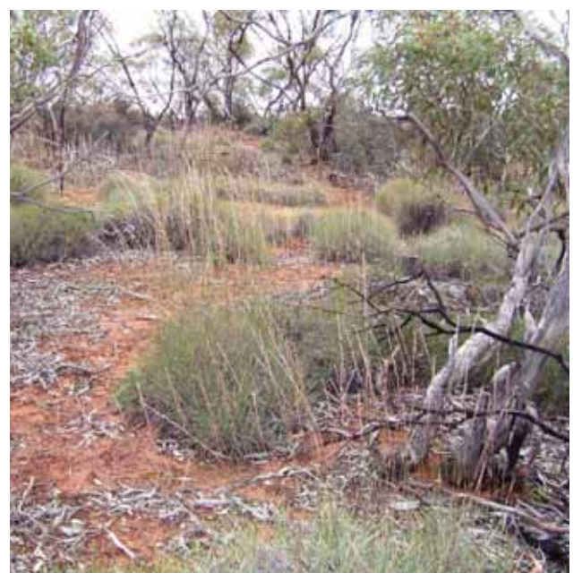
Striated Grasswren habitat at Cooltong Conservation Park

A lot of grasswren habitat was cleared during the last century, which not only greatly reduced their population size, but also left them scattered in isolated remnants across the landscape. These isolated populations face greater risks of decreased genetic health and of being lost to wildfires, as there may be no way for them to move between habitat patches. Fire and drought acting together in a fragmented and degraded landscape are this species' largest threats. Illegal trapping for the aviculture industry is a localised problem and could heavily impact smaller populations.