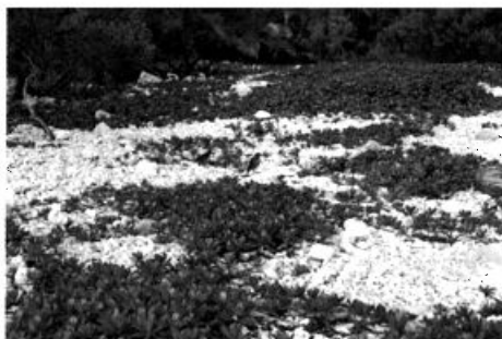
Fig. 4. Dwarf Scaevola plants comprise one of the preferred feeding areas of Tuamotu Sandpipers.

frequently seen taking nectar and/or water from flowers of Scaevola (Fig. 4), and unspecified seeds were also taken (R. Pierce pers. obs.). Stomach contents have contained ants (four species), leafhoppers and a wasp (Juglar 1996).