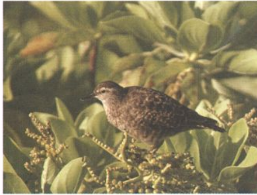
Fig. 2. Tuamotu Sandpiper on the shrub Messerschmidia .

pipers and smaller populations were also found on Reitoru and Tahanea in the central and northern Tuamotu (Pierce et al. 2003). Thus in 2003 the following populations were known: