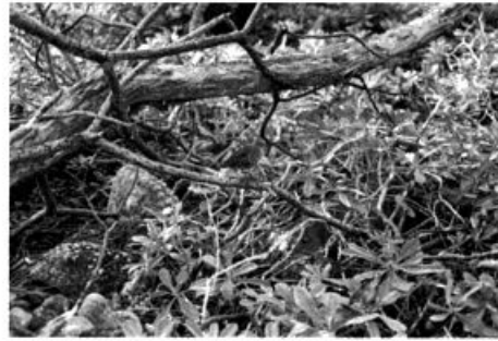
Fig. 6. Shrubland habitat at the edge of a channel on Vahanga.

In the short term (<5 years) the goal must be to ensure the species does not become extinct. In the long-term (5–20+ years) the goal could include the reintroduction of populations of Prosobonia across its former broad geographic range. Both of these goals are dependent on the availability