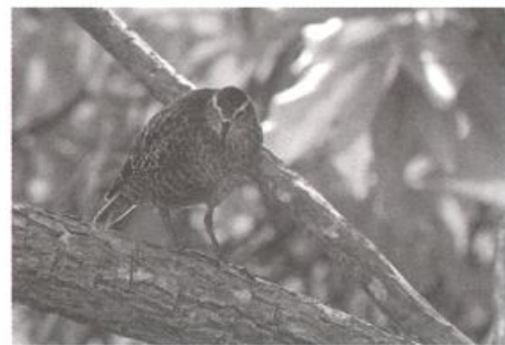
Fig. 3. Tuamotu Sandpiper on a tree trunk.

Food is taken from a variety of situations, the key ones being from the surface of the ground, from litter of Pandanus , Messerschmidia and other trees, from the under-surface of leaves on low shrubs, from bark of trees and from the branches, leaves and flowers of shrubs and trees (Fig. 3). Food comprises mainly invertebrates, but also a significant amount of plant material. On Tenararo and Vahanga in October 2000 and July 2001, invertebrate food observed included ants (at least two species), cockroaches (at least 3 species), sandflies and centipedes. On all atolls, birds were