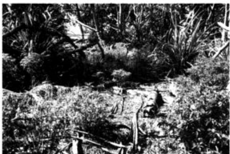
Fig. 5. Forest and shrubland habitat utilised by Tuamotu Sandpipers at Tahanea.

The largest surviving populations of Tuamotu Sandpiper occur on two small (<200 ha), uninhabited and mammal-free atolls, Morane and Tenararo. The third largest population occurs on the large atoll of Tahanea (Fig. 5) where it is only common on the few very small motu of that atoll that lack predatory mammals, and none or very few were found on c.20 motu that supported cats Felis catus and/or rats (Pierce et al. 2003). The fourth largest population known is on the small atoll of Reitoru where the sandpipers occur at low densities on all three forested motu. All three Reitoru motu also supported Pacific rats or kiore Rattus exulans at moderate to low densities in March 2003.